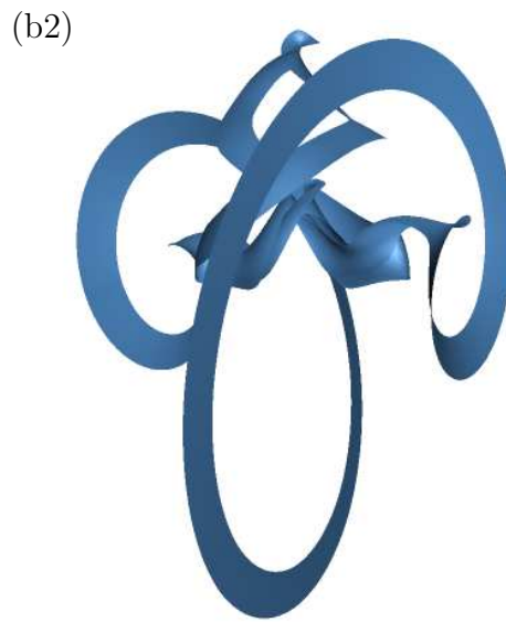
Figure 2: The sculpture Manifold (left column) and its computer-generated equivalent (right column); the two view points are the same as in Figure 1.