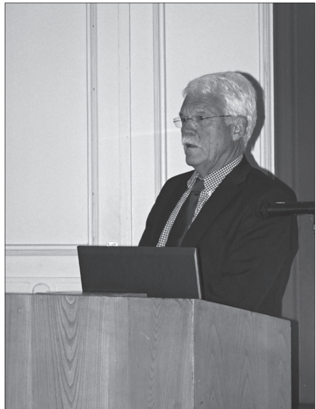
Abb. 2 Den öffentlichen Festvortrag hielt der ehemalige Präsident des Deutschen Archäologischen Instituts, Hans-Joachim Gehrke.